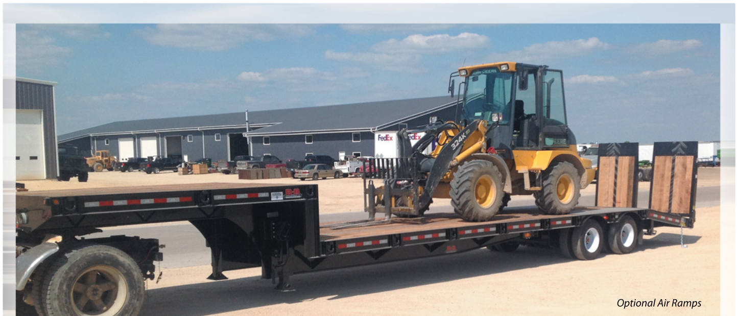
Optional Air Ramps