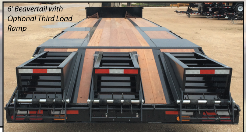
6' Beavertail with Optional Third Load Ramp