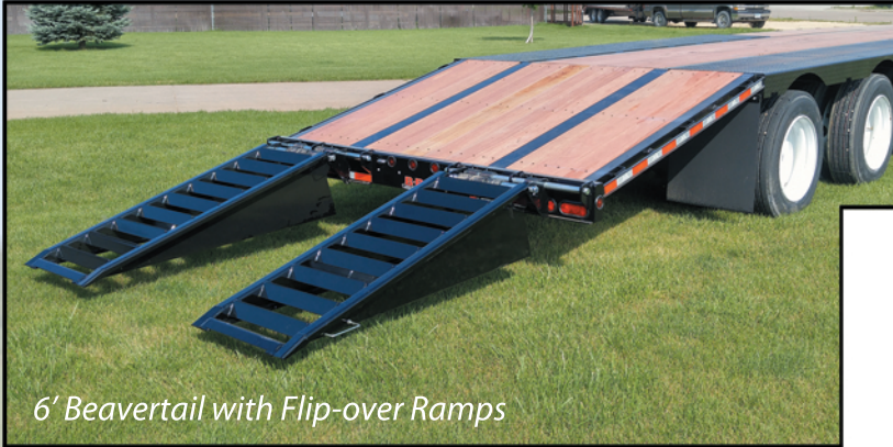
6' Beavertail with Flip-over Ramps