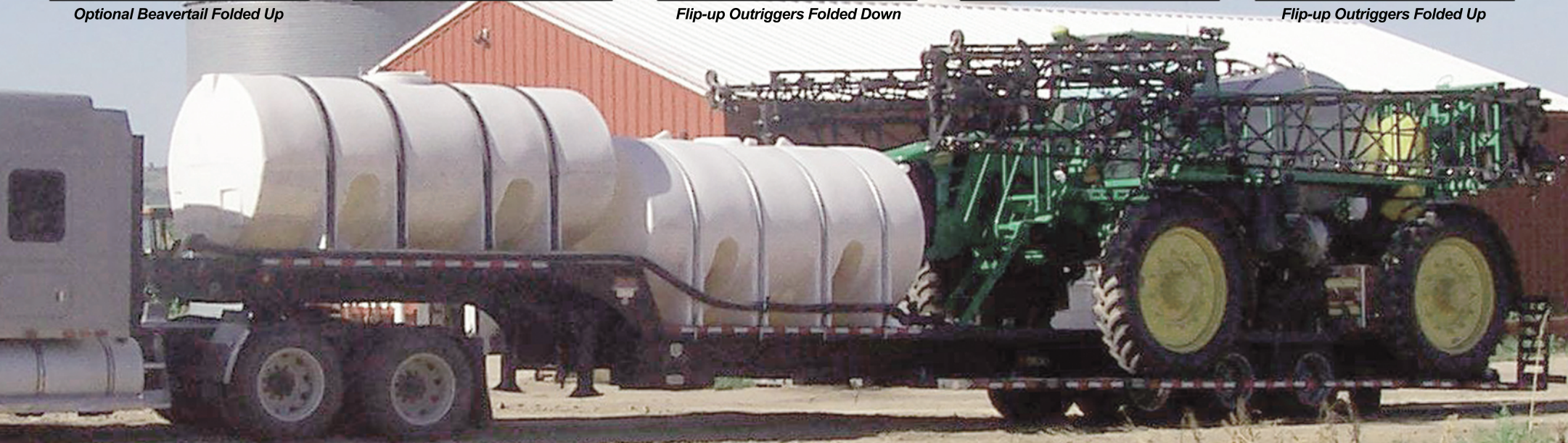
Flip-up Outriggers Folded Up