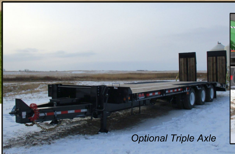
Optional Triple Axle