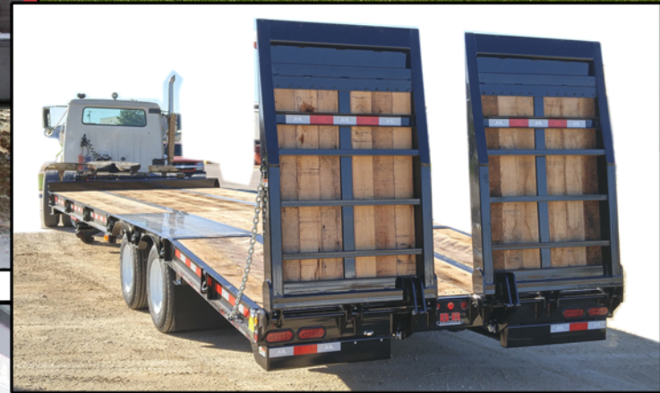
Optional Air Ramps