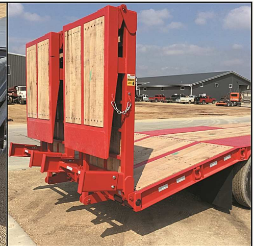
FB8X32SDPT-50H with Optional Hydraulic Bi-Fold Ramp