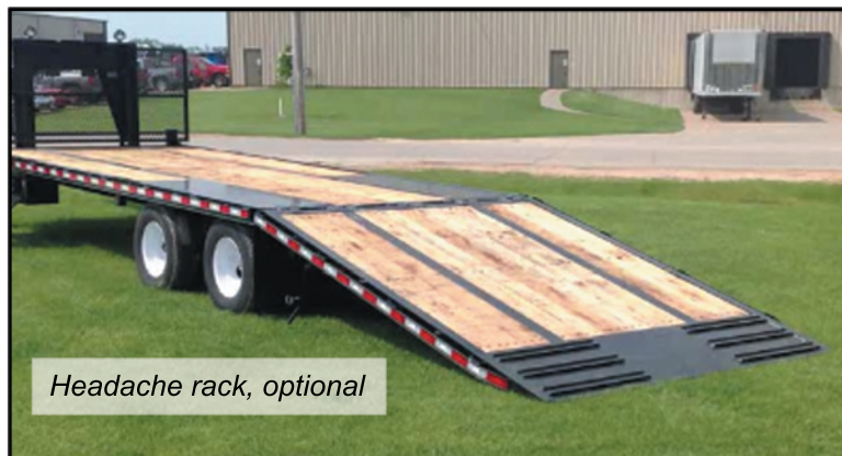
Headache rack, optional