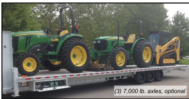
(3) 7,000 lb. axles, optional