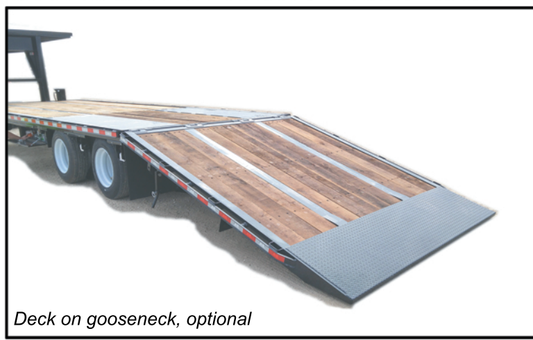
Deck on gooseneck, optional

Manufactured by: Behnke Enterprises, Inc. 800 Ninth Ave. NW, Farley, IA 52046 www.behnkeenterprises.com Ph. (563)744-3246/Fax (563)744-9066