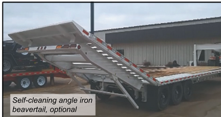
Self-cleaning angle iron beavertail, optional