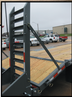
Optional extend-a-bed in down position