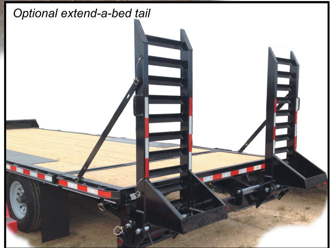
Optional extend-a-bed tail